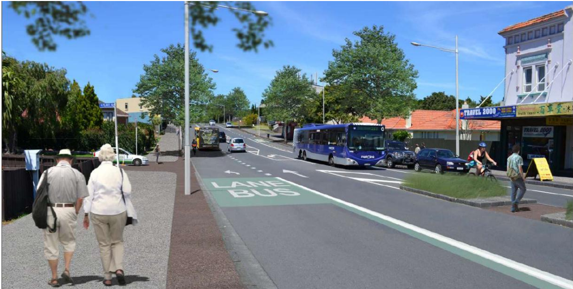
Figure 2: Artist's impression of the current concept for mid-block sections

A visualisation of the mid-block section is shown in the artist's impression below.