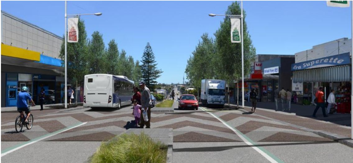
Figure 3: Artist's impression of the current concept for Mt Roskill Village Centre (looking towards the CBD)

Mt Roskill Village Centre: An artist's impression of the proposed option through the village centre is shown in Figure 3 below.