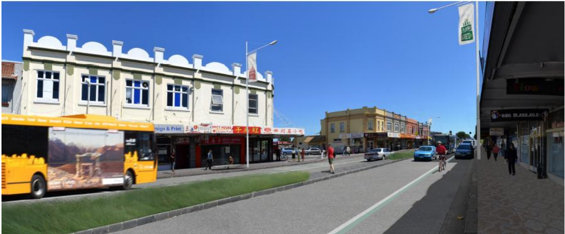
Figure 4: Artist's impression of the current concept for Balmoral Village Centre (looking northbound towards Wiremu Street intersection)

Eden Valley Village Centre: The narrow cross section will be applied between Onslow Road and Grange Road. The option adopts a similar approach to the other two village centres, providing continuous bus lanes through the village centre and removal of all indented parking, which is replaced with parking in the bus lanes (off peak times). The removal of indented parking/bus bays will provide opportunity to increase footpath amenity as depicted on the artist's illustration below. A central median will also be introduced as for the other village centres.