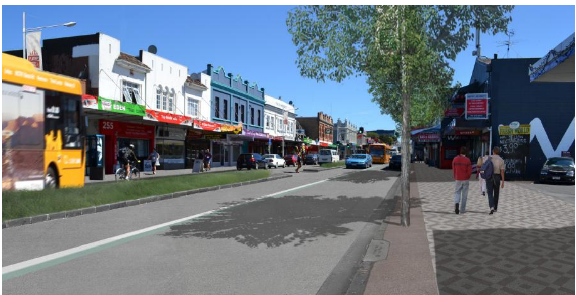
Figure 5: Artist's impression of the current concept for Eden Valley Village Centre

An artist's impression of the proposed option through the village centre is shown in Figure 5 below.